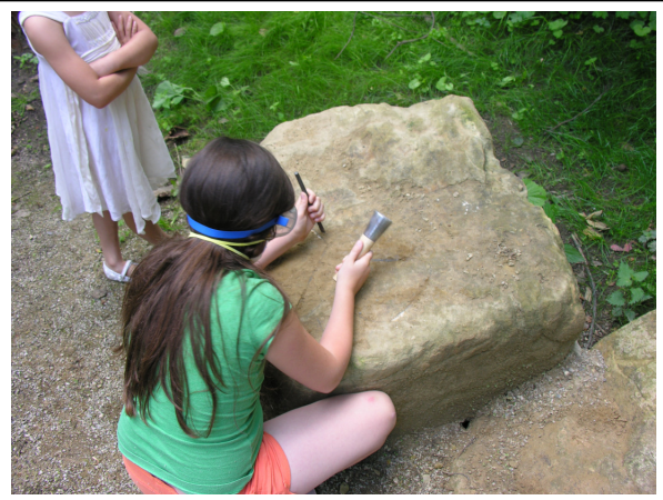
The local children were involved in stone carving workshops and other artwork projects on the site. This is to encourage a sense of ownership and pride