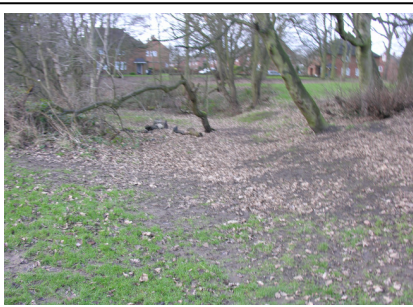
The site had been neglected and under used for years